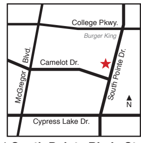
6311 South Pointe Blvd., Ste 600 Fort Myers, Florida 33919